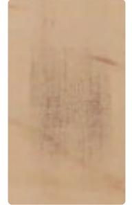
Typical 2-Part Finish