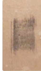
Typical 1-Part Finish