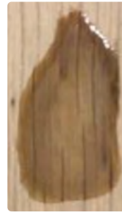
Typical 1-Part Finish