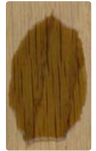
Typical 2-Part Finish