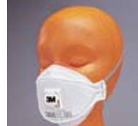
Respirator dust mask. For sanding and vacuuming protection.