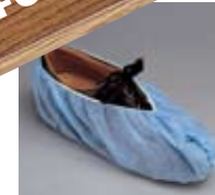
Slip cover shoe and floor protectors.