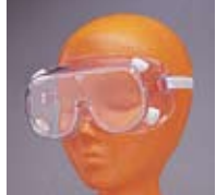
Protective eye goggles. Wear over prescription eyewear, side protection, ventilation and fog resistant.