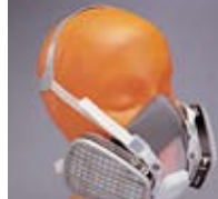
Forty hour, disposable, half mask, organic vapor respirator.