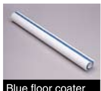
Blue floor coater pad refill package.