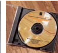
WOODFORCE CD A comprehensive "how to" program.