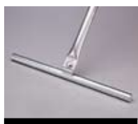
18" Big Foot, heavyweight, T-bar floor coater.