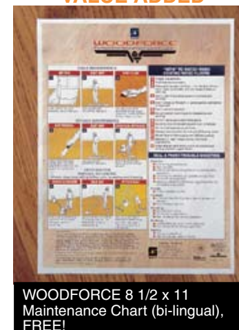
WOODFORCE 8 1/2 x 11 Maintenance Chart (bi-lingual), FREE!